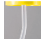
bent dip tube