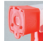
door foamer (spray/foam)