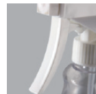
3 finger actuator (US)