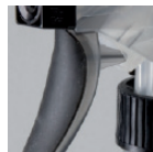
bi-colored actuator (US)