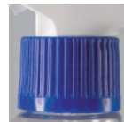
28x3 non removable