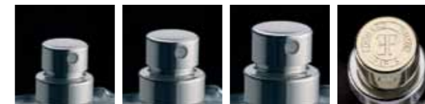
11.8 / 11.8 H